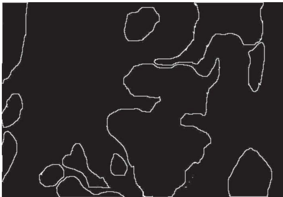
Figure 2 – Binary image resulted from the extraction of the contours in Figure 1